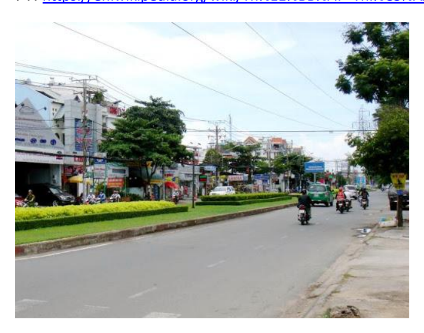
Đường Trần Não with 4 lanes.