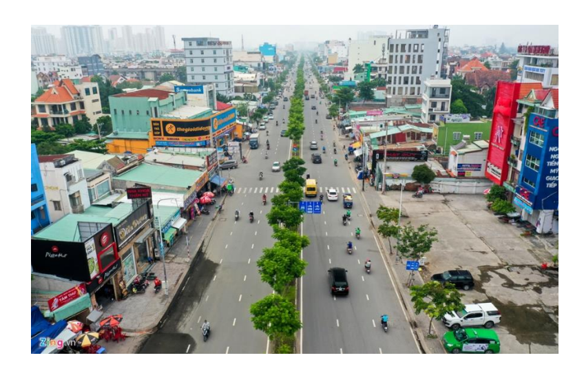
Đường Trần Não with 6 lanes.