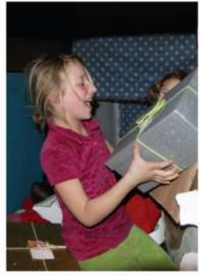
WHY WE ARE PROUD OF WHAT WE DO

Christian Response is proud to be a totally voluntary charity whose roots go back to 1690. Our Christmas shoebox appeal is in addition to the Boup Kitchers, medical and educational projects, family support etc. we provide each year. We invite people to pack a shoe-box with new items suitable for a child or an adult, or even fill a much bigger box for a complete family.