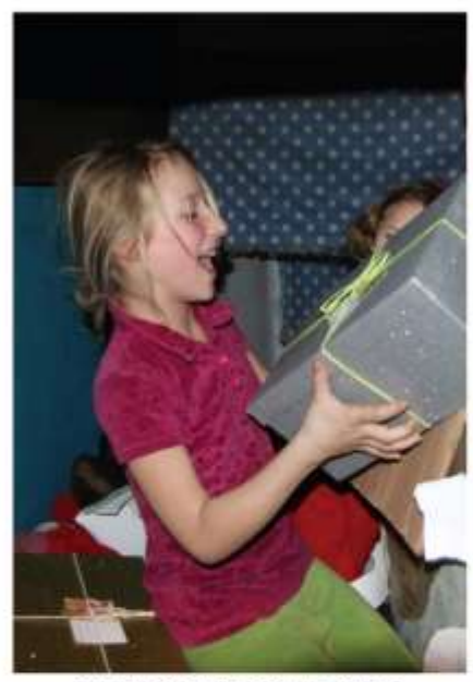
WHY WE ARE PROUD OF WHAT WE DO

Christian Response is proud to be a totally volu Christian Response is product to be a robustly volumity charity whose roots go back to 1990. Our Christmas shoebox appeal is in addition to the Soup Kitchens, medical and educational projects, family support etc. we provide each year. We invite people to pack a shoe-box with new firms suitable for a child or an adult, or even fill a much bigger box for a complete family.