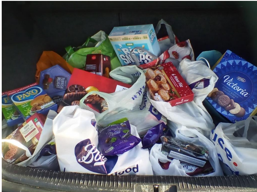
Our collection of groceries sent to THAT last week